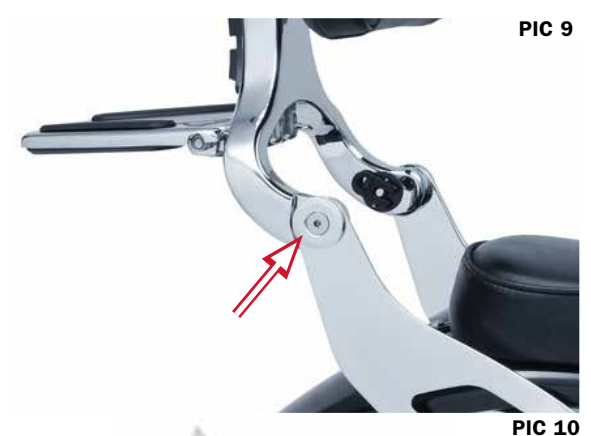
APPLY THREAD LOCK TO SCREW

IT IS THE INSTALLER'S RESPONSIBILITY TO ENSURE THAT ALL OF THE FASTENERS (INCLUDING PRE-ASSEMBLED) ARE TIGHTENED BEFORE OPERATION OF THE MOTORCYCLE. KURYAKYN WILL NOT PROVIDE WARRANTY COVERAGE ON PRODUCTS OR COMPONENTS LOST DUE TO IMPROPER INSTALLATION OR LACK OF MAINTENANCE. PERIODIC INSPECTION AND MAINTENANCE ARE REQUIRED ON ALL FASTENERS.