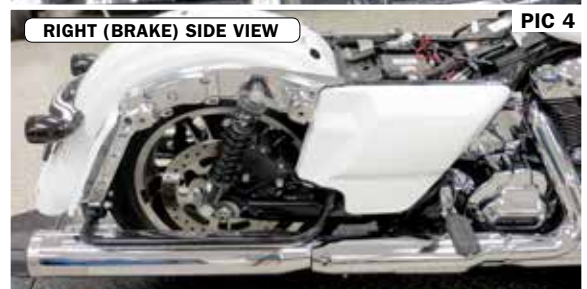
RIGHT (BRAKE) SIDE VIEW