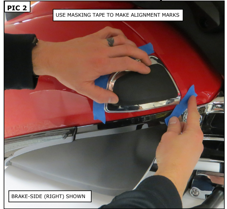
STEP 3 Position the Right Saddlebag Front Scuff Protector as shown in PIC 2 . Use masking tape to make alignment marks; remove the Right Saddlebag Front Scuff Protector.